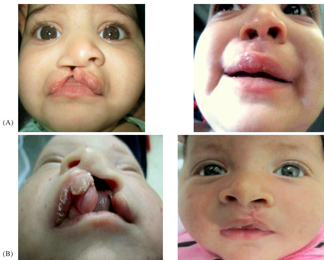
Fig. (4): Pre and (6) months postoperative view.

None of the patients had wound dehiscence, hypertrophic scarring or keloid formation.