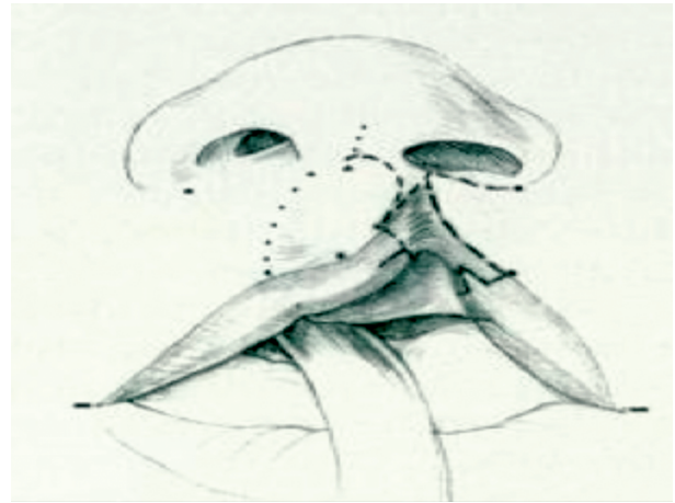
Fig. (1): Marking for lip repair.

Parent's satisfaction was assessed by parent questionnaire, if it is excellent fair or not satisfied.