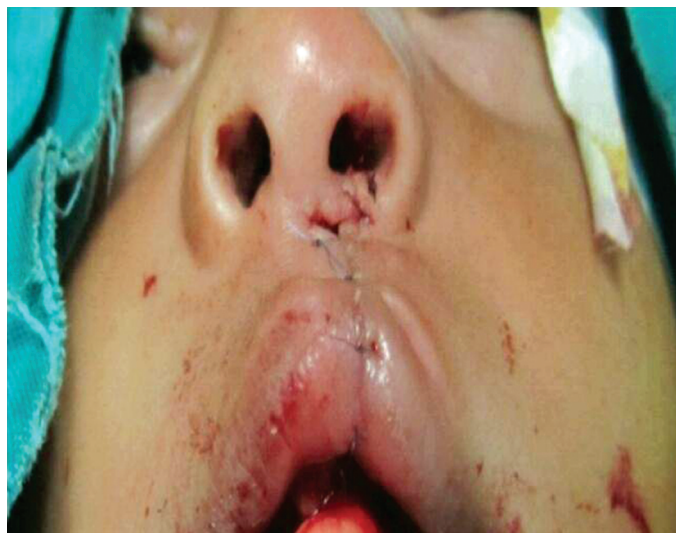
Fig. (2): McComb's technique.